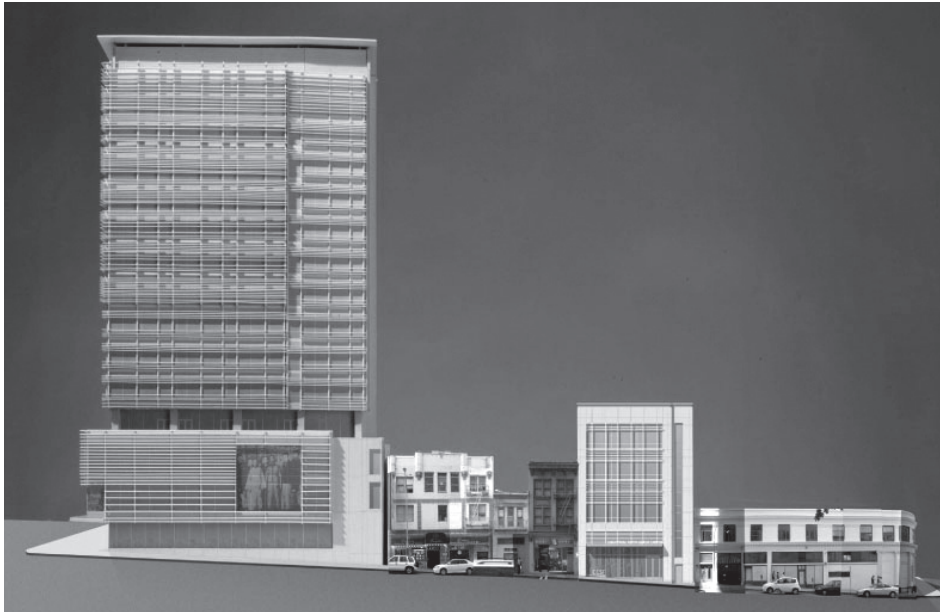
The two buildings of the new City College campus designed by EHDD and Barcelon and Jang. EHDD 和 Barcelon and Jang 設計的新市立大學分校兩座建築物。

CAA and allies continue to move the long-awaited permanent City College campus for San Francisco Chinatown closer to reality. In April and July, CAA testified and help organized the community to help secure necessary votes from the City College Board of Trustees to approve the designs of the two buildings that will comprise the campus. Though opponents have filed two lawsuits