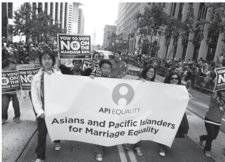
API Equality volunteers at the San Francisco Pride Parade.