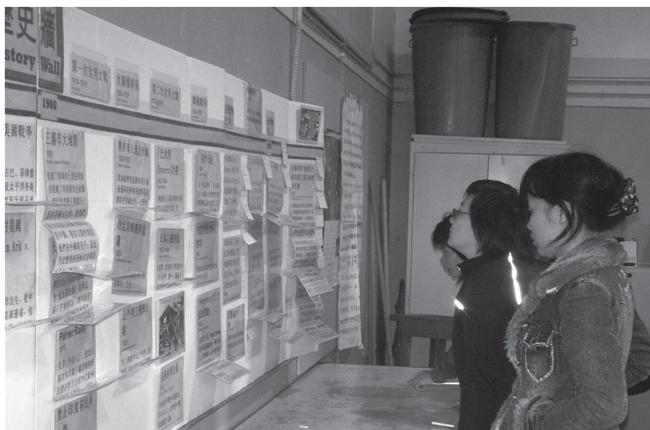
Visitation Valley parents read over the Immigrant History Wall.